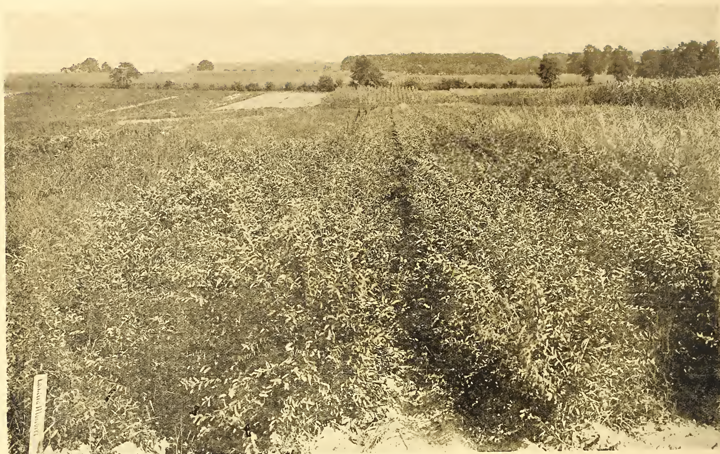
Our Bush Honeysuckles